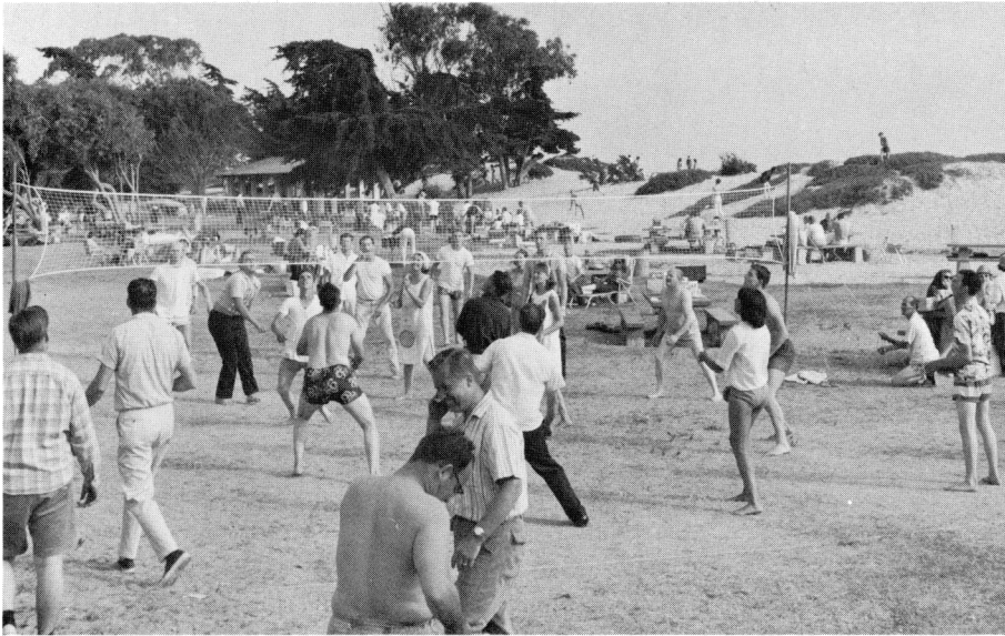
VOLLEYBALL —Members from Santa Barbara and Glendale enjoy vigorous game of volleyball during outing at Carpenteria State Beach.