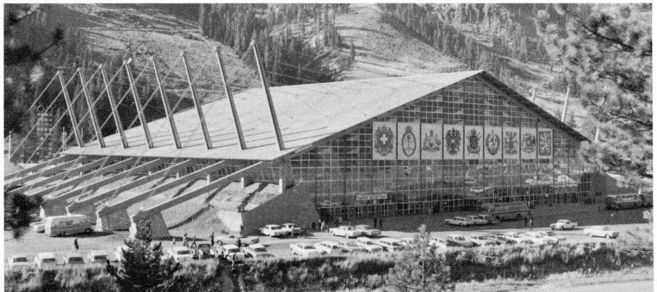
BELOW—Large fur trees and rugged mountain slopes enclose the place where God has placed His name.