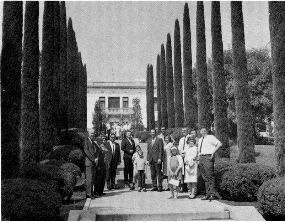
CAMPUS TOUR —Standing on the walkway to Ambassador Hall, Glendale members pause for a moment on eye-opening tour of college campus.