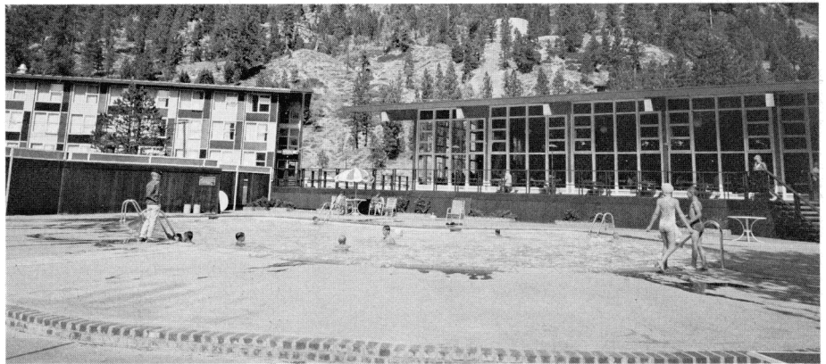
ABOVE—The heated swimming pool by the side of the cafeteria is a spot for happy children.

Order and cooperation were evident throughout the day which continues to be the keynote of any gathering of God's people.